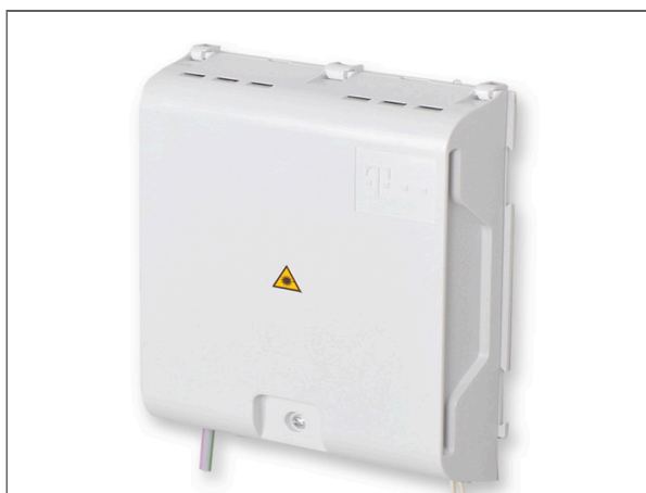
Building Access Terminal (BAT), Size L, gray, EMKA lock, 16 cable strain reliefs